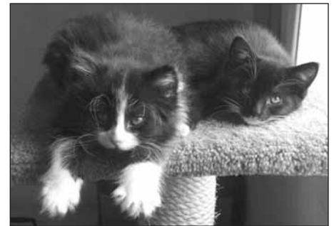
Kodi and Kona

“time-limited commitment” and says, “It’s great — you’re getting free kittens for a short period of time!”