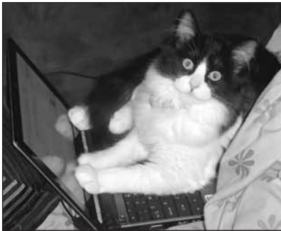
Ladybug checking her e-mail

Phone: 360-452-0414 Fax: 360-452-0412 E-mail: pfoa@olympen.com